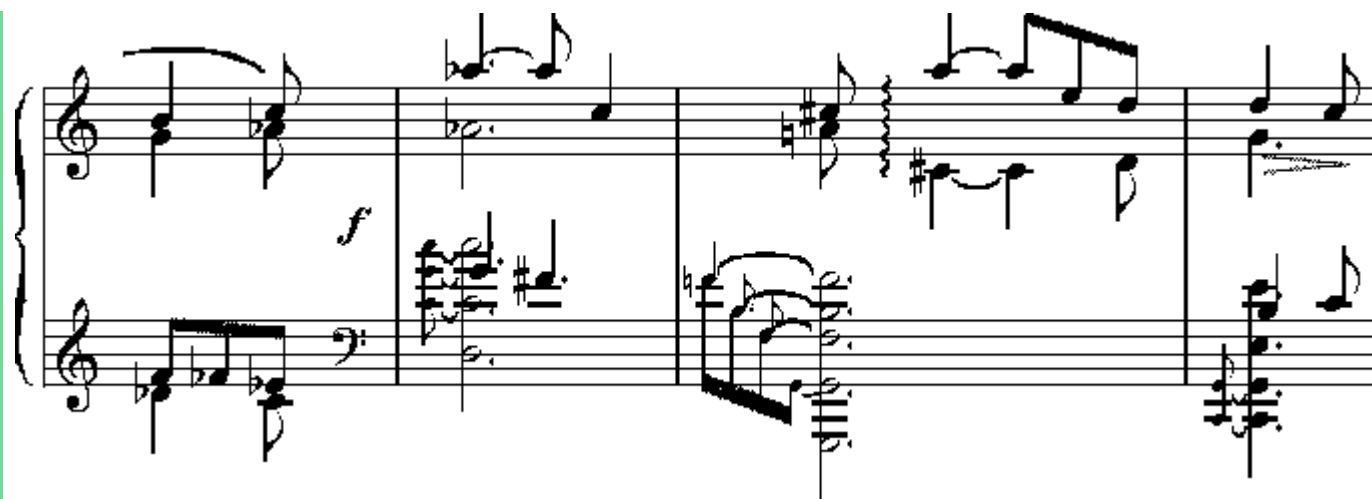
3. Prelude Fis-Dur op. 37 Nr. 2 (1903), T. 6-8: