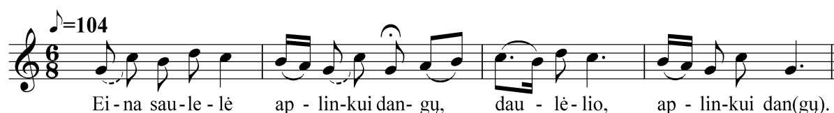
Figure 12: Joninės and wedding song contamination ‘Eina saulelė aplinkui dangų’ (Barauskienė, Kazlauskienė and Uginčius (1962, 243); Čiurlionytė (1938, 141)).

Seeing the sun off. Keywords: sunset, heavenly family (cosmological parallels), evening. Perhaps the most beloved and ‘obligatory’ song at present is a Joninės and wedding song contamination ‘Eina saulelė aplinkui dangų’ (Fig. 12): “The sun is circling the sky to wake up the moon. Wake up, bright moon, I woke already a long time ago and irradiated the whole world, the old one, the young one, the small one, and the big one...”.