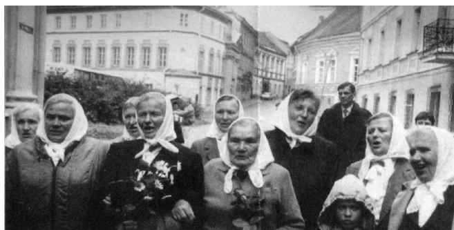
Figure 2: Mištūnai singers at a folklore festival “Skamba skamba kankliai” in Vilnius, 1990s.

In 1992–94, the Lithuanian Folk Culture Centre organised long-term fieldwork in Mištūnai. 5 In terms of time span, it was in fact a synchronic project. This type of fieldwork was common in Lithuanian practice, known as a “depth project” (Goldstein 1964, 71) or “general sampling of a community’s musical culture” (Nettl 1964, 66). Besides other kinds of folklore and ethnographic material, over 300 songs were recorded. In addition, some 100 songs were recorded repeatedly from the same informants, including recordings at concerts and in a record studio. Twenty of these songs appeared in an audiocassette (Ambrazevičius 1999b).