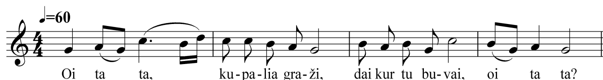
Figure 10: Crop visiting – Joninės song ‘Oi ta ta, kupalia graži’ (Barauskienė, Kazlauskienė and Uginčius (1962, 242 and 681)).

At the kupolė pole. Keywords: kupolė , rounding up. Songs and roundelays with references to kupolė are used. For example, ‘Oi ta ta, kupalia graži’ (Fig. 10): “Oi ta ta, beautiful kupolė, where were you? I was in a field to look after rye. Whose rye is the finest? Jonas’ rye is the finest...”; ‘Kupolio rože’: “Kupolė the rose, where were you, Jonas? In a rye field. What did you do? I picked kupoliai...”. 23