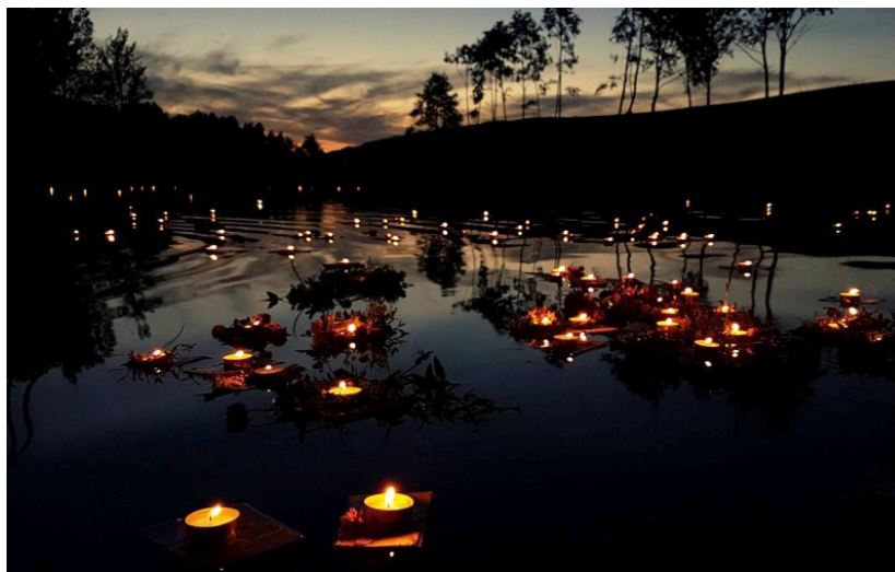
Figure 8: Wreaths with candles floating on water. 20

At some moments, the poles with wooden wheels soaked in tar are burnt and the burning torches are prepared. A procession with the burning torches proceeds to visit various sites, such as fields, streams, hills, outstanding trees, and so on. The main destination is a stream or lake where girls put their wreaths on wooden crosspieces with candles attached and then set them afloat on the water (Fig. 8). The faster the wreath recedes from the shore or the faster the stream current carries it, the sooner the girl will get married. Fellows may swim to catch the wreaths of their beloved, this way expecting to get them married.