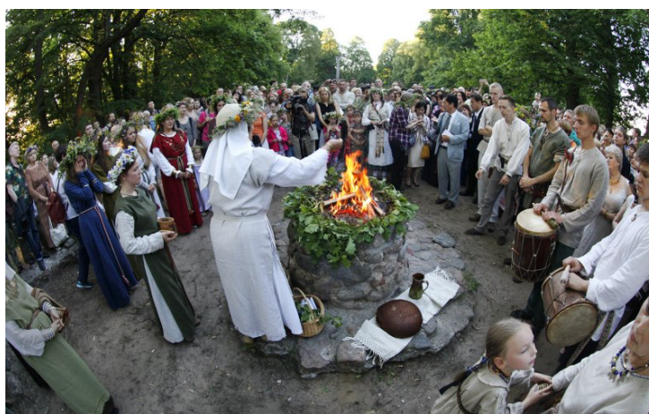
Figure 7: Lighting the altar. 18

Then there is bidding farewell to the sun and proceeding to the altar, a small construction of stones with a bit of wood on it prepared for the fire. The altar is usually set up near an oak – a sacral tree or the ‘king of trees’ for the Balts. Lighting the altar (Fig. 7) is the most sacral element in the celebration agenda. Remembrance and honouring of ancestors, as well as sharing bread and beer around the fire, are frequent activities.