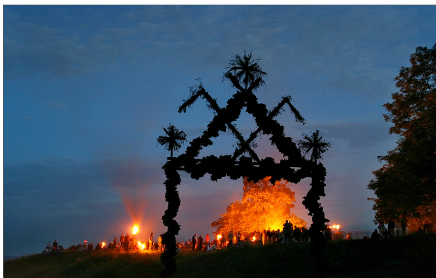
Figure 9: Rasos gate and bonfire. 21

is common to wash faces with the dew and to walk barefoot in the grass, believing in healing qualities of the dew.