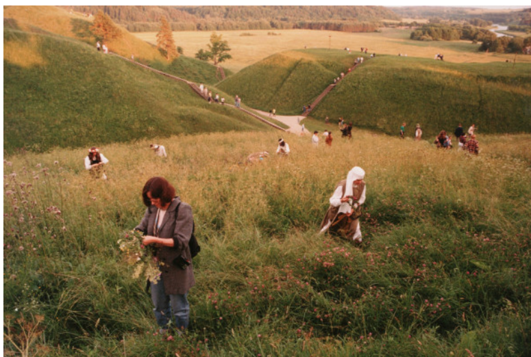
Figure 6: Kupoliavimas (herb gathering). 17

Then there is bidding farewell to the sun and proceeding to the altar, a small construction of stones with a bit of wood on it prepared for the fire. The altar is usually set up near an oak – a sacral tree or the ‘king of trees’ for the Balts. Lighting the altar (Fig. 7) is the most sacral element in the celebration agenda. Remembrance and honouring of ancestors, as well as sharing bread and beer around the fire, are frequent activities.