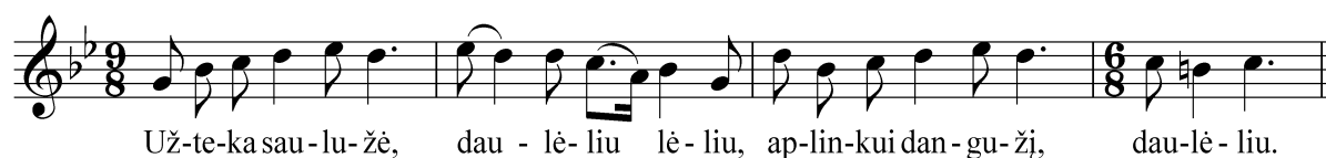
Figure 14: Wedding song ‘Užteka saulužė aplinkui dangužį’ (adapted from Juška (1955, 538–39 and 751)).

Tab. 3 summarises observations about usage of different genres in the composing of the “Rasos metagenre.” The numbers in the cells stand for the corresponding numbers of textual types. Only the textual types highly anchored in the repertoires are considered. “N” stands for cases when not only certain textual types are adapted, but rather the entire (sub)genre (or its significant part) suits the discussed situation. The question marks point at uncertainties of the cases, i.e., quite individual and inadvertent appearances of the considered song genres in the Rasos repertoires. In other words, usage of the indicated genres is highly probable, yet no distinct instances of fixed textual types are observed.