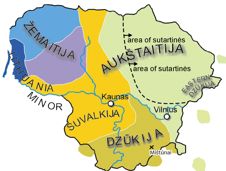
Figure 1: Ethnographic regions of Lithuania. Design: Ambrazevičius.

Even though Lithuania is a small country, it is traditionally divided into four main ethnographic regions. These divisions are based on spoken dialects, traditions, and other cultural elements: Aukštaitija (east), Žemaitija (west), Dzūkija (southeast), and Suvalkija (southwest) (Fig. 1). Musical dialects approximately correspond to these ethnographic divisions.