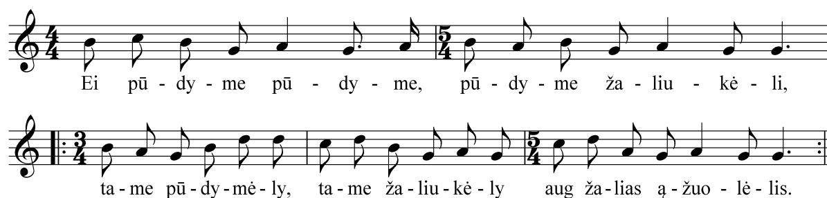
Figure 13: Family (orphan) song ‘Ei pūdyme pūdyme’ (adapted from Juška (1955, 376–79 and 810)).

Lighting the altar. Keywords: oak, fire, patriotism, ancestors, sacredness. The topics are probably the most difficult to determine. Since this part of the celebration is the most sacral, the participants usually choose repertoire which is sacral, extraordinary, and consolidating for the feasting group. Remembrance of ancestors is honored, therefore orphan, war-historical, and patriotic songs (even the Lithuanian anthem) are naturally included, especially songs with expressive and abundant symbolism. The orphan song ‘Ei pūdyme pūdyme’ (Fig. 13) serves as a typical example: “A green oak stands in a lea; our father lays under this hundred-branched oak. We two orphan sons will go to visit our father...”.