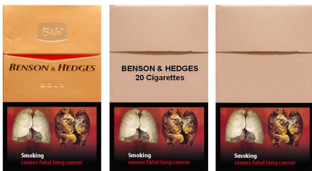
Figure 2. Example of GWLs applied to branded, plain and blank cigarette packages. Adapted from Maynard and colleagues (2014).

saliency of those warnings. This included using both larger and graphical warning labels (GWLs), and to associate them with standardized plain packages which do not have brand information (Fig. 2). Longitudinal surveys executed before and after the introduction of plain packages in Australia in 2012 (Wakefield et al., 2015) and in the United Kingdom and Norway in 2017-2018 (Moodie et al., 2021) indicated that observers subjectively had the impression that warnings had become more effective after the introduction of plain packaging, and crucially that they noticed the warnings more.