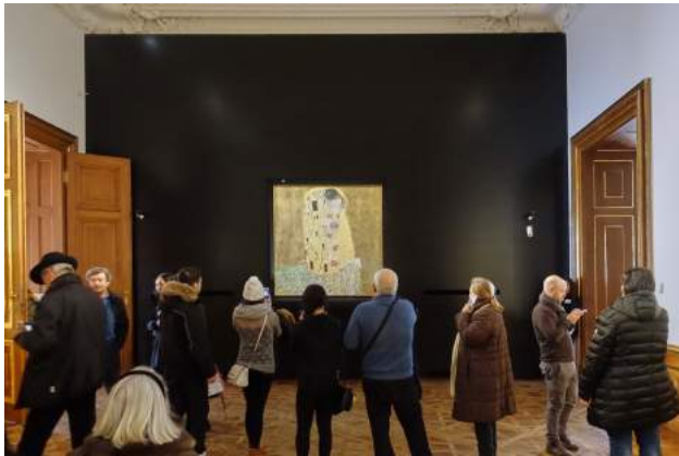
Figure 5. Installation shot with “The Kiss” in BB