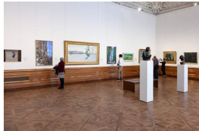
Figure 10. Installation shot with “Evil Mothers” (center) in BA