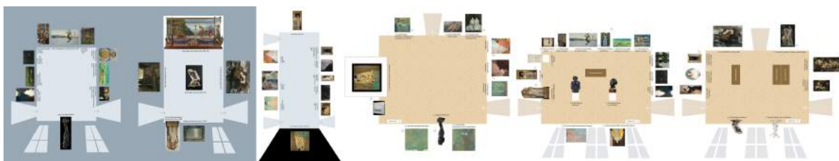
Figure 3. Map with 26 artworks in BB and map with 35 artworks in BA

Second, the art historical narration in the single exhibition rooms has changed drastically. This includes a new exhibition course, with most of the pieces of our set now in the East wing instead of the West wing of the building. In BB the course of the rooms synthesized a narration that led from works by Hans Makart, the most successful painter in Vienna before Klimt (in our acclimatization room), to the presentation of the Viennese Secession (in Rooms 1 and 2) to a rich compilation of Klimt's works including the most famous, "The Kiss" and "Judith," at opposite far end walls (in the large Room 3). In BA, Klimt's paintings are no longer presented together in one large room, but distributed according to chronology and motifs; moreover, they are now matched with works by fellow contemporary artists. Besides curatorial reasons, this