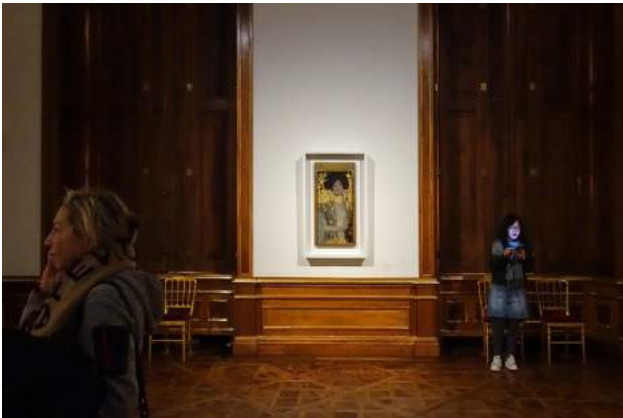
Figure 7. Installation shot with “Judith” in BB