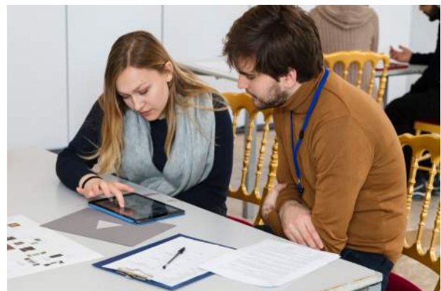
Figure 2. Subjective mapping following the exhibition visit