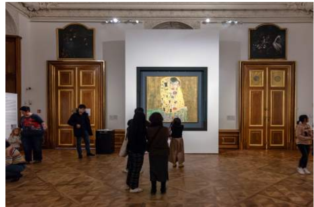
Figure 6. Installation shot with “The Kiss” in BA

according to viewing times shows a strong consistency between the higher and lower ranks of these thirteen artworks in BB and BA. Regardless of their display, certain artworks remain in the focus (see ranks 1–7), while others consistently receive less attention time (see ranks 8–13). Among the artworks in the focus of attention, there is of course “The Kiss,” (see Figures 5 and 6) as participants often stated in the subjective mappings when they recalled their exhibition visit. This is not surprising, as “The Kiss” is the most prominent artwork of the museum and one that most visitors were already familiar with, having seen it before either in the original or as a reproduction (BB 77.98%, BA: 74.67%). In addition, works by widely known artists such as Klimt, van Gogh or Munch led to a heightened awareness, as visitors felt they “had to stop because it was from a famous painter” (ba-s075) or “of course [...] had to pay attention” (bb-s001) to these works.