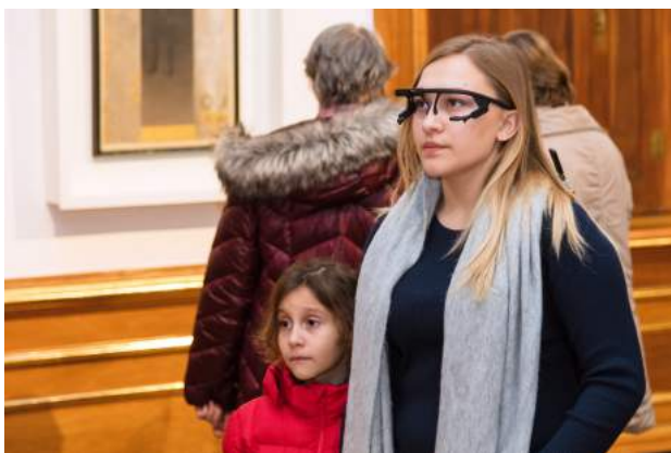
Figure 1. Individual exhibition visit with MET equipment

MET has already been applied in museum studies (see above) and proven to be an insightful method due to the richness of the data gained, which also enables statistical analysis (Eghbal-Azar & Widlok, 2013; Garbutt et al., 2020; Mayr et al., 2009). However, one of the main challenges of employing MET is extracting semantic meaning from the raw gaze data in relation to the stimuli (e.g., a painting on the wall of the museum), as these stimuli are consistently viewed from different perspectives. The eye movement data regarding the objects looked at (e.g. a specific artwork or label) is not a direct output of the recording software but a video of the scene camera with an estimated gaze point relative to the video frame. Moreover, regular fast-paced head movements (leading to motion blur in the captured images), the low dynamic range of the eye tracker's field camera, and frequent partial occlusion of artworks due to the presence of other visitors make the automatic labeling a challenging task. Given these technical