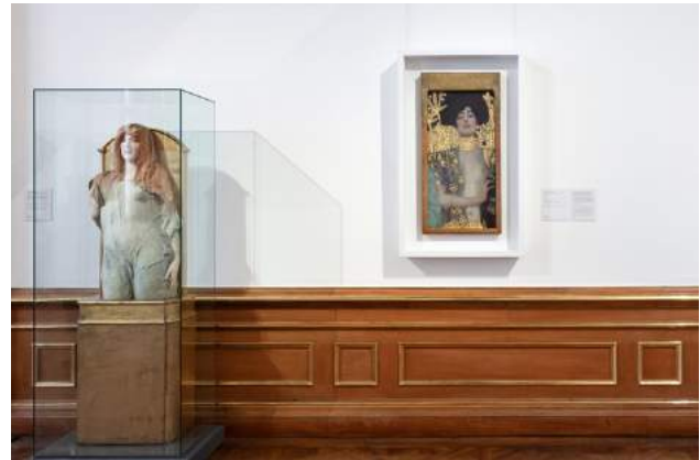
Figure 8. Installation shot with “Nymph” and “Judith” in BA

in BA with references to the biblical story of Judith and Holofernes or a general “gender trouble”, as indicated in the caption.