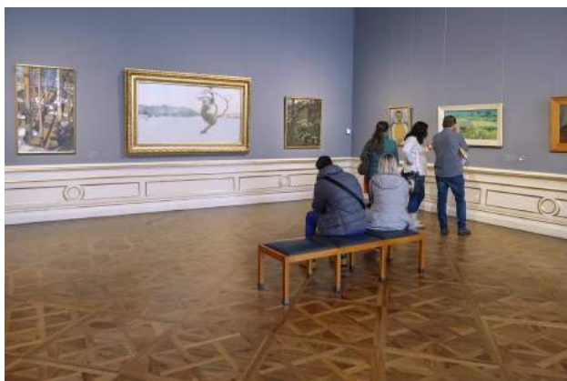
Figure 9. Installation shot with “Evil Mothers” (center) in BB

Analyzing the time that visitors spent looking at the art and the accompanying labels (see Figure 10 as well as Tables A3 and A4 in the Appendix), we note a large shift from BB to BA: The mean total viewing time (including artwork and label) increased from 17.73 sec ( SD = 21.96 ) to 26.14 sec ( SD = 26.04 ) for the thirteen artworks that were presented in both settings. The introduction of new identification labels, and—in the case of four works—also