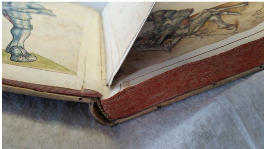
Fig. 19: View of the interlude of pages between the album's first and second quires, all glued onto the same short tip that forms folio 12, Thun-Hobenstein Album, Prague, Uměleckoprůmyslové museum v Praze, GK 11.572-B, folio 10-12.

The three folios that support the fifteenth-century drawings cling to a single, short tip of early-seventeenth-century paper that is contiguous with the tips used to anchor the drawings in the album's second quire (fig. 19). Thus, folio 12, whose recto forms the surface to which the fragmentary drawing of fifteenth-century swordsmen is pasted, constitutes both the last of the inserted drawings and the first leaf of quire two.