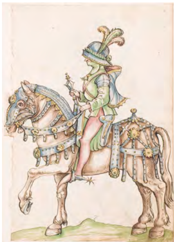
Fig. 4 (left): Thun Artist A, Rider armoured in the style of circa 1480 riding a horse lightly armoured in the style of circa 1510, circa 1530-1540, Thun-Hohenstein Album, Prague, Uměleckoprůmyslové museum v Praze, GK 11.572-B, folio 8r.