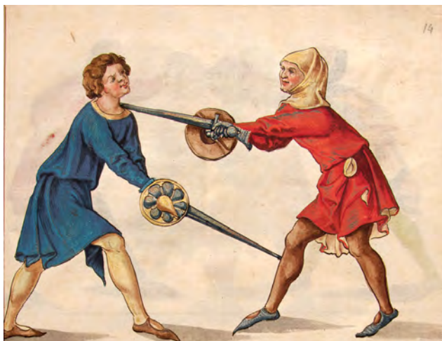
Fig. 16: Jörg Breu the Younger, Sword and Buckler , Paulus Hector Mair, Sammelband ( Ring- und Fechtbuch ), Universitätsbibliothek Augsburg, Cod. I.6.2.4, fol. 14r.

Fechtbuch , not only includes Breu's characteristic images of fencers and grapplers clad in elaborately puffed and slashed sixteenth-century fashions. It also contains mid-sixteenth century illustrations that adopt the style of the fourteenth century; in doing so, these images acknowledge the perceived authority of late medieval martial traditions. Folios 14 and 15 depict combat with sword and buckler (fig. 16). Although illustrated by Jörg Breu the Younger during the 1540s, their content and style evoke far older works, such as the so-called Walpurgis Manuscript, Royal Armouries I.33. 74 The costume and facial physiognomies of Breu's figures echo those in this rare early fencing treatise, and suggest that Breu may have had access to a manual of similar date from Mair's or another Augsburg collection.