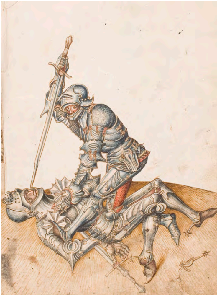
Fig. 2: Unknown Artist, Subduing an Opponent , after circa 1495, ink and wash, Thun-Hohenstein Album, Prague, Uměleckoprůmyslové museum v Praze, GK 11.572-B, folio 12r.

they predate the images that surround them by up to five decades and represent fifteenth-century pictorial and literary genres that established visual languages of the armoured body that resonate through the album's later drawings.