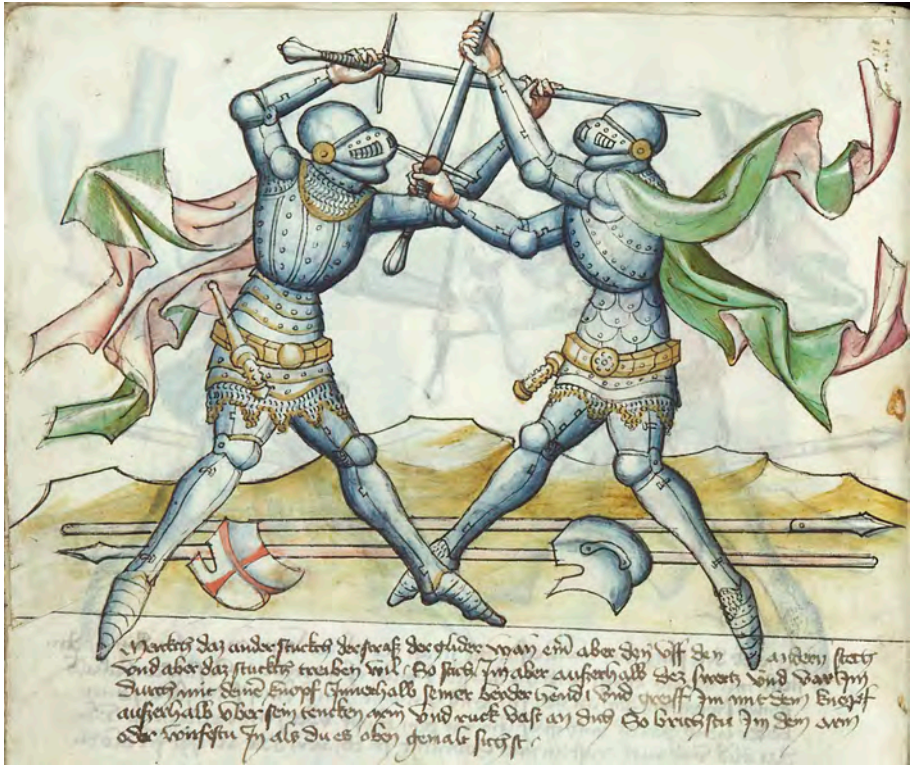
Fig. 10: The “Way of the Joints,” Gladiatoria , circa 1430, Vienna, Kunsthistorisches Museum, KK 5013, fol. 11v.

That last phrase, “as you see it painted above,” is a refrain, repeated on nearly every page throughout the Gladiatoria codices. Importantly, these manuscripts not only demonstrate textual expansion of the zedel , but also the increasing emphasis on images of combatants, which were once illustrative accompaniments to the Fechtmeisters’ verses, as important sites of knowledge that participated in dialogue with the text and expanded upon the meanings that it conveyed to the reader/viewer. 61