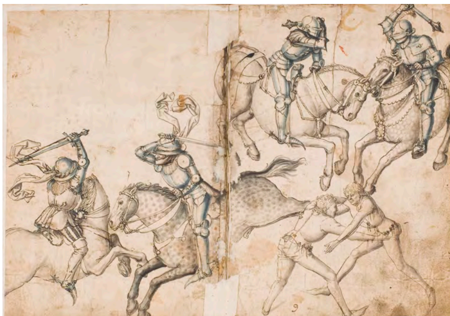
Fig. 1: Unknown Artist, Study of Three Pairs of Combatants, circa 1470s-1480s, ink and wash, Thun-Hohenstein Album, Prague, Uměleckoprůmyslové museum v Praze, GK 11.572-B, folio 10v-11r.

The vanquished man's sword lies beneath his body, and he looks upward toward the victor's weapon, poised to deliver a final strike through the unfortunate man's open visor.