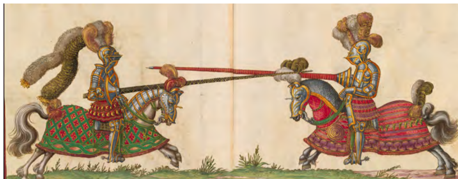
Fig. 17: Jörg Breu the Younger, The Joust of War in Armets , from Paulus Hector Mair, De Arte Athletica , Bayerisches Staatsbibliothek, Cod. icon. 393.b, folios 106v-107r

sum of 800 Gulden. 75 This work, almost entirely illustrated by Breu the Younger himself, uses layers of metallic washes to evoke the iridescent surfaces of blued steel armour and weapons. The sections on mounted combat in armour, in particular, use veils of metallic wash to vividly approximate the plate armour for which Augsburg was famous (fig. 17). Their shimmering, closely observed visualizations of the armoured body parallel the roughly contemporary sixteenth-century drawings that the Thun album collects. However, Breu the Younger's heavy layers of opaque pigments beneath the metallic washes differ markedly from the translucent application of pigments employed by both of the artists whose works comprise 101 of the album's 112 images.