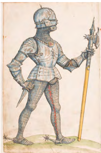
Fig. 20 (left): Artist A, Thun Hohenstein Album , folio 9v, Armour for the Freiturnier (Free Tournament) of 1515-20, 1540s.