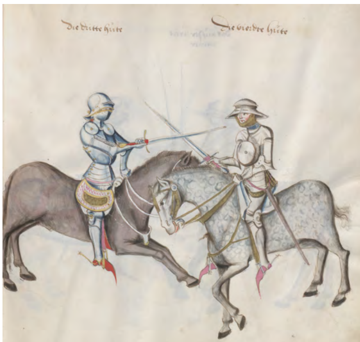
Fig. 13: The Third and Fourth Strikes, Paulus Kal's Fechtbuch for Ludwig of Bavaria, Bayerische Staatsbibliothek, Cgm. 1507, fol. 13r

to introduce the basics of swordplay. In contrast to the page’s minimal text, the two figures and their steeds are fully visualized, and do indeed bear striking parallels to the mounted pairs who spar in the opening of the Thun album. The figure on the left sweeps his sword toward his opponent in the underhanded “Third Stroke”, his upturned wrist exposing the red lining of his armoured gauntlet; the right-hand figure, whose war hat and dappled mount recall his counterpart in the Thun album, deflects his opponent’s blow with a firm, over-handed strike. While the text barely alludes to these skillful movements, the images dramatically enact them on the page, and prompt the viewer to do so in his mind.