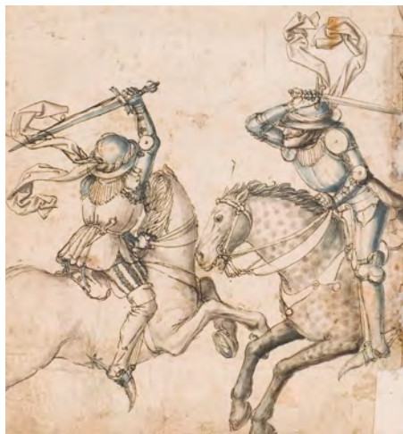
Fig. 5 (right): Unknown Artist, Study of Three Pairs of Combatants (detail), circa 1470s-1480s, ink and wash, Thun-Hohenstein Album, Prague, Uměleckoprůmyslové museum v Praze, GK 11.572-B, folio 10v.

Like the figures who grapple on the facing page, these cavalymen parallel the illustrations that populate contemporaneous fight books. Once again, Talhoffer's fight book from 1467 offers analogous content with striking stylistic parallels. Although the mounted swordsmen who gallop across the Munich manuscript's pages do not wear leg armour, their clothing and war hats echo those worn by the Thun riders. Furthermore, their grisaille forms and inky outlines recall the style of the Thun drawing. Talhoffer's personal manuscript, now in Copenhagen, offers additional comparative examples from the 1450s. This volume's illustrations of mounted grappling and of a mounted lancer and crossbowman each visualize figures whose clothing and armour resonate with the mounted swordsman in the Thun opening, down to the fabric-covered bevors that the figures in each illustration sport.