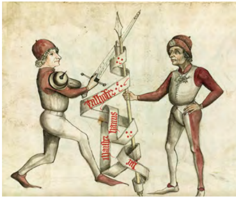
Fig. 11 (left): Hans Talhofer, wearing the badge of the Marxb Brüder, and a student, 1459, Copenhagen, Det Kongelige Bibliotek, MS Thott.290.20, fol. 101r.