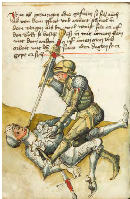
Figs. 7 (left) and 8: Unknown Augsburg book painter, Unhorsing an Opponent (left) and Subduing an Opponent , from Peter Falkner, The Art of Knightly Defense , Vienna, Kunsthistorisches Museum, KK 5012, fols. 72r-v.

The violent and fragmentary depiction of two figures locked in combat on Thun folio 12r bears a striking resemblance to the final illustration of a fight book written in the 1490s by Peter Falkner, a fencing master and captain of the illustrious guild of swordsmen, the Marxbrüder or Brotherhood of Saint Mark (fig. 8). The Kunst zu Ritterliche Were , or The Art of Knightly Defense , includes instructional verses and illustrations on unarmoured fencing with a longsword and Messer (a single-edged sword), as well as foot combat with daggers, staves, shields, and clubs. 32 The treatise also describes strategies for fighting on horseback