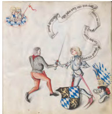
Fig. 12: Dedicatory Miniature, Paulus Kal's Fechtbuch for Ludwig of Bavaria, Bayerische Staatsbibliothek, Cgm. 1507, fol. 5r.

As fight books relied increasingly on pictorial communication, the indoctrinated viewer would have been called upon to “textualize” the minimally captioned or completely unannotated images. Like the laconic verses so often deployed in the genre, the illustrations of martial manuals functioned as mnemonic prompts that could induce viewers to recall not only the verbal rhymes associated with them, but entire repertoires of movement and strategy. Thus, the glimpses of armoured and unarmoured combat that appear in the Thun album’s fifteenth-century drawings could have stimulated viewers’ recollection of the actions that constituted particular fighting traditions, the verses that helped commit them to memory, and the absent masters who taught them.