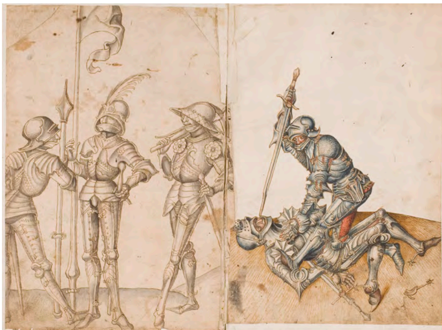
Fig. 22: Unknown Artists, Thun-Hohenstein Album, Prague, Uměleckoprůmyslové museum v Praze, GK 11.572-B, folios 11v and 12r

their armoured bodies. Along the page's trimmed left edge, a man leans away from the picture plane; his back turns toward the viewer and exposes the back sides of his pauldrons as they cascade over the raised, linear decoration of his backplate. This soldier extends his preternaturally long leg, revealing the hinges that close his cuisses and greaves, as well as the protective wings of his poleyns, or knee cops. A visored sallet protects his head, and a bevor covers his chin. This figure, whose back is turned to the viewer, leans on a spear as he grasps a barely visible sword in his left hand, carelessly resting its point on the ground. He seems to be in conversation with the image's central figure, whose sallet has no visor, but is crowned with a tall plume. The man holds a lance from which a banner flutters, but his gauntleted hand seems to grasp only air; the lance, apparently added after the rest of the drawing was composed, dissolves into transparency as its shaft meets the more substantial figure.