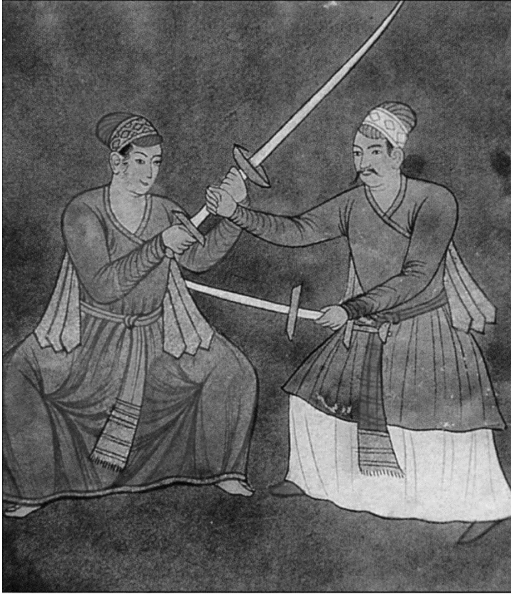
Figure 6: Fencing with the mel puttah bemoh, the Indian two-handed rapier. Anonymous, Nihang-Nama, 18 th century (New Delhi, National Museum).