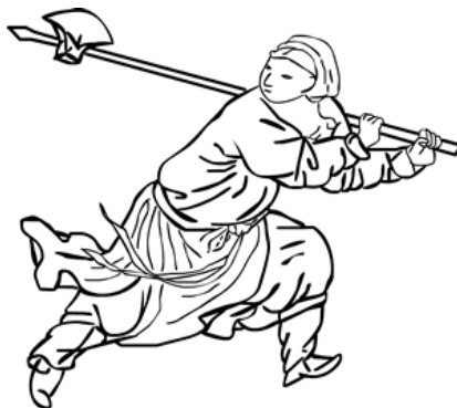
Figure 2: Position with the long shaft axe. Cheng Zi Yi, Long Shaft Axe, unknown date.