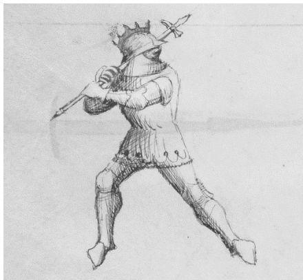
Figure 1: Posta de donna. Fiore dei Liberi, Il Fior di Battaglia, ca. 1410 (Los Angeles, J. Paul Getty Museum, MS Ludwig XV 13, fol. 35v).

other without much confusion. 9 And even a superficial look will provide many examples of (seemingly) similar body positions and stances (see Fig. 1 and 2). 10