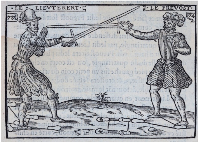
Figure 4: Footwork patterns. Saint Didier, Traicte , 1573, fol. 58r.