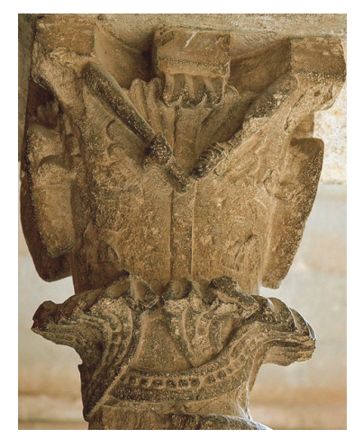
Fig. 1: Capital 75 of the cloister of Sant Cugat, 12th century showing two men fighting with sticks – that may be a depiction of trial by combat.<sup>22</sup>

Most documents simply mention trial by combat with no specification about how this combat was conducted. Nevertheless, sometimes in the eleventh century we find the fixed expression – cum scuto et bastone – and it seems that this custom of doing judicial combat with only a stick and a shield was still in place in the twelfth century.<sup>21</sup>