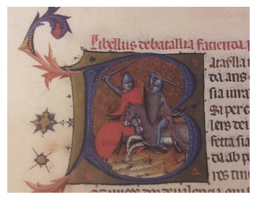
Fig 2: Illuminated Initial from the Llibre Verd de Barcelona, 1346.40

Usatges as an appendix and thus is preserved in twenty-seven manuscripts.<sup>36</sup> A modern critical edition of De batalla , with a rigorous contextualisation of the short treaty, does not yet exist.<sup>37</sup> The only edition was published by Pere Bohigas in 1947, who based his text on eight manuscripts all preserved in Barcelona.<sup>38</sup> He also signals earlier editions, mostly based on a singular or a small number of manuscripts.<sup>39</sup>