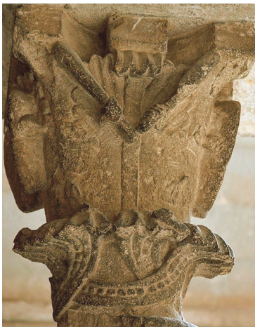
Fig. 1: Capital 75 of the cloister of Sant Cugat, 12th century showing two men fighting with sticks – that may be a depiction of trial by combat. 22

Most documents simply mention trial by combat with no specification about how this combat was conducted. Nevertheless, sometimes in the eleventh century we find the fixed expression – cum scuto et bastone – and it seems that this custom of doing judicial combat with only a stick and a shield was still in place in the twelfth century. 21