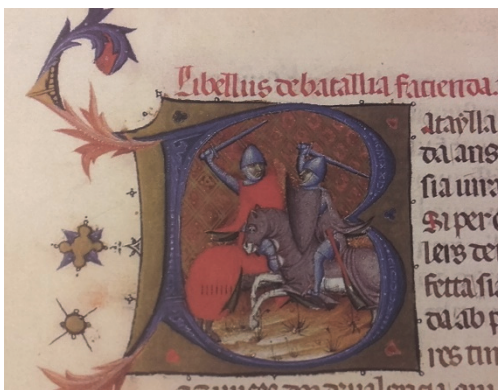
Fig 2: Illuminated Initial from the Llibre Verd de Barcelona , 1346. 40

Usatges as an appendix and thus is preserved in twenty-seven manuscripts. 36 A modern critical edition of De batalla , with a rigorous contextualisation of the short treaty, does not yet exist. 37 The only edition was published by Pere Bohigas in 1947, who based his text on eight manuscripts all preserved in Barcelona. 38 He also signals earlier editions, mostly based on a singular or a small number of manuscripts. 39