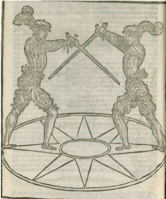
Figure 4: Achille Marozzo, Opera Nova, 2 nd book, fol. 47 v (Munich, Bayerische Staatsbibliothek, Res/4 Gymn. 26). Reproduced with permission.