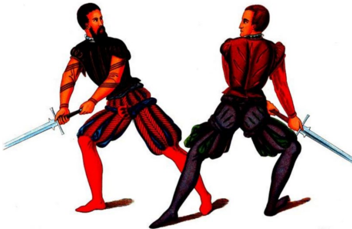
Figure 2: Hefner-Alteneck, Trachten, Kunstwerke und Gerätschaften , plate 489.