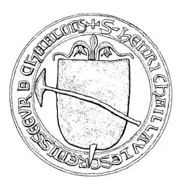
F.g. 2 Seal of Henri Chaillau, featuring a spiked shield and horned club. Fourteenth century. After Paris, Archives nationales, Collection de sceaux, no. 5860.

Outside of south German lands and the Assises de Jerusalem , specialized duelling shields occurred only as isolated outliers. In the Archives Nationales de France, a seal dated broadly to the fourteenth century depicts a duellist's club with horns superimposed over a heater-type shield bearing a spike in the centre of its rounded lower rim. From behind the centre of the shield's upper edge, a shaft and spearhead protrude. Two other lines emanating from the shield's upper edge may represent either decorative curlicues or hooks that were part of the shield. The legend around the rim reads "Seal of Henri Chaillau, the fencer of Châlons."<sup>28</sup> Although horned clubs are found in some sources from the French-speaking realm, this appears to be the only French reference to a spiked duelling shield.