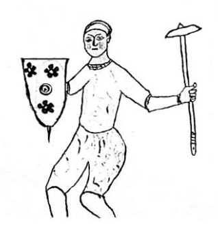
Fig. 1 Duellist carrying a spiked shield and horned club, from a manuscript of the Assises de Jerusalem. After Oxford, Bodleian Library, MS Selden Supra 69, f. 104r (detail).