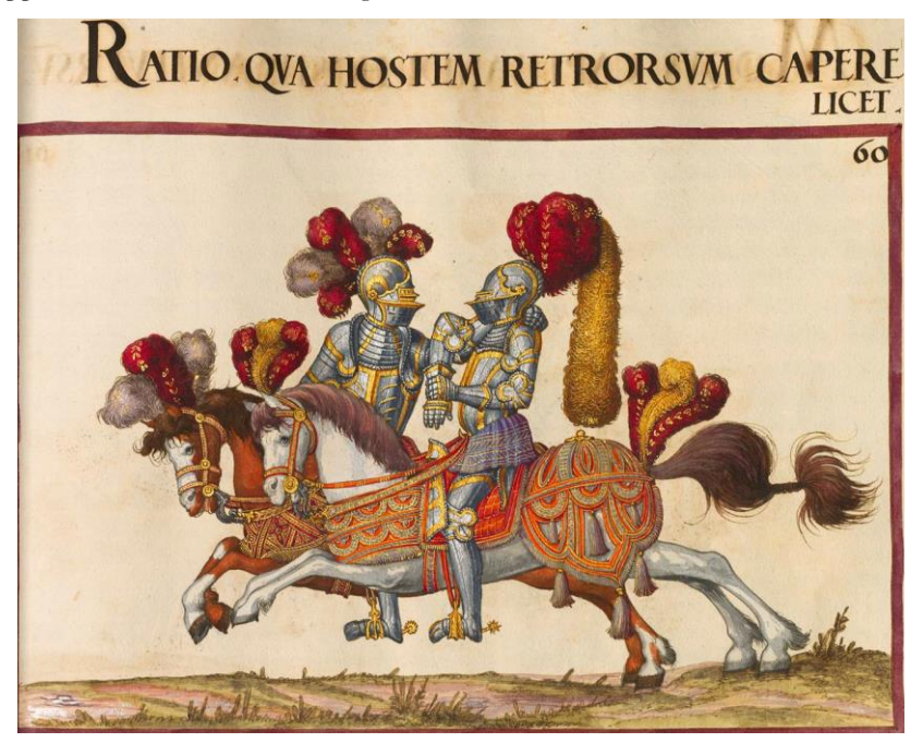
Figure 1: Ratio, qua hostem retrorsum capere licet. "A way, which allows to grab the enemy from behind". Mair, Paul-Hector, De Arte Athletica (München: Bayerische Staatsbibliothek, Cod.icon.393, middle of the 16th century, t.II, pl.60, f°198r°)

Horseback fighting goes through three stages directly related to the combat distances or measures involved. We can also find these in German fight books through the use of the lance, the longsword, and wrestling. The first is used as the two knights meet, as in jousting. In the second step, each fighter tries to dominate their adversary and hit him with a sword or a mace. Finally, at the shortest distance, wrestling is used to either disarm, lock the opponents' arms, or throw him off his horse. The different tactics are very well described<sup>25</sup>. Some are quite similar to those that can be found in the German fight books, specifically for arm wrestling, where the opponents try to twist each other's arms into different locking positions with both horses facing the same direction, as in a pursuit, or in opposite directions, when coming face to face.