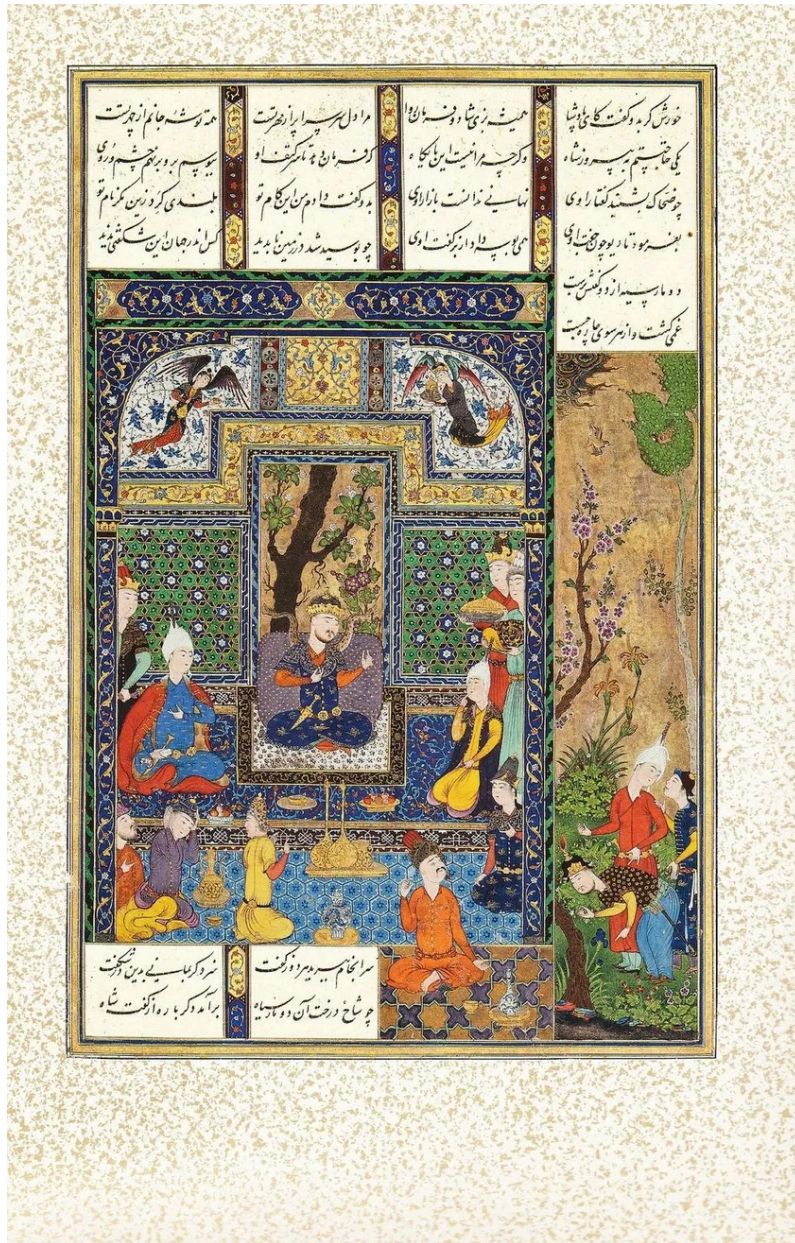
Figure 1: Iblis Kisses Zahhak's Shoulder and the Snakes Grow, folio 26v from the Shah Tahmasp Shahnama (between 1522-1535, Tabriz), attributed to Sultan Muhammad, Tehran Museum of Contemporary Art. Reproduced in Shahnama-yi Shah Tahmasp, Tehran Museum of Contemporary Art, 2021, 29/ 308.