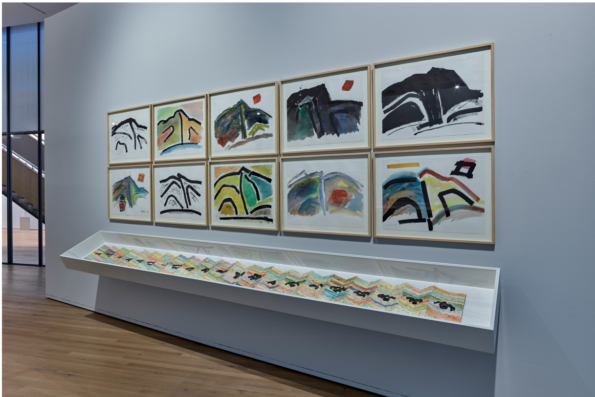
Figure 1: Etel Adnan, The Mountain, series of ten drawings, watercolor and china ink on paper, 2014 (display on wall). Etel Adnan, Journey to Mount Tamalpais, watercolor and ink on paper, 2008 (leporello in display case). Exhibition at Zentrum Paul Klee, Bern, 15 June – 7 October 2018.

Adnan's commitment against the war in Algeria led her to join the protest movement against the Vietnam War, as did many intellectuals in the United States at the time. Many were expressing their opposition against the war with their literary work, and so did Adnan, in her first poem in English, "The Ballad of the Lonely Knight in Present-Day America," which was published in the ephemeral S. B. Gazette in 1965. She now had two new languages, painting and English, in which she could express herself.