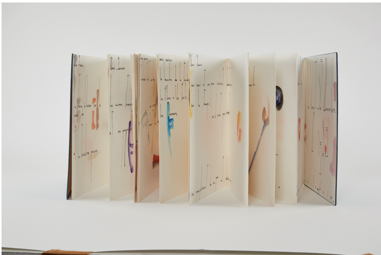
Figure 2: Etel Adnan, Wendell Berry, 26 November 1964, leporello, 1964. Exhibition at Zentrum Paul Klee, Bern, 15 June – 7 October 2018.

Adnan has a strong passion for Arabic poetry, including pre-Islamic poems. However, since her position is political, she "draws" only poems by contemporary authors, like the Palestinian Mahmoud Darwish, whom she knew personally and who translated some of her poetry and of whom she says he was "constantly close ... to the existential." 22