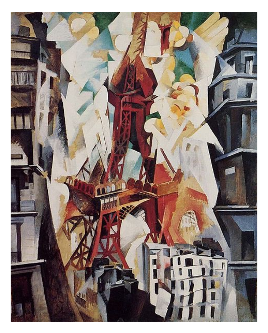
Figure 3: Robert Delaunay, Champs de Mars, La Tour rouge, 1911, oil on canvas, 160.7 × 128.6 cm. Art Institute of Chicago.

Artists of the great movements of 20<sup>th</sup> century abstraction discovered and practiced a vital historical step towards a renewed formal language of pictures. The Impressionists accomplished an important first step to abstraction by giving pictures the power to generalize. Details were dramatically reduced and instead replaced by attention to atmospheric conditions. An attitude of working directly from nature was adopted by the Impressionists, which allowed color and light to become central considerations of greater importance than verbal narrative. Atmospheric luminosity replaced precision and detail in defining place, time, and season. In many Impressionist paintings, the way parts related to each other helped identify the whole, even those parts that alone are unrecognizable. In some Impressionist paintings, groups of brush marks were organized to imitate groups of things in nature. This was a first in the history of pictures: that a group of marks – by the nature of their grouping – imitate relationships of groups of objects in reality.