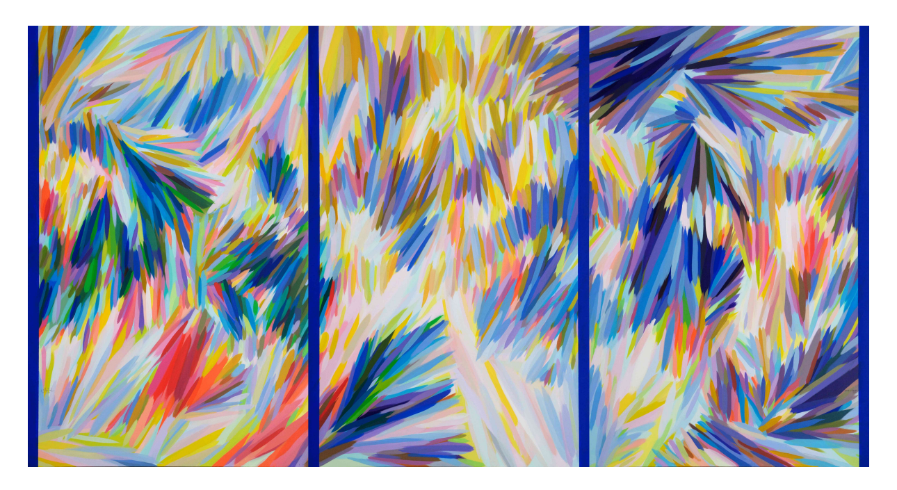
Figure 6: Samia Halaby. Homage to Leonardo, 2012, acrylic on canvas, 224 x 421 cm. Private collection, Dubai.

While working-class bureaucrats were denying abstraction, imperialists and the bourgeoisie were claiming 20<sup>th</sup> century abstraction as their own. Thus, the claim that abstraction is Western, and not the fruit of a creative wave of optimism riding working-class motion, means that any artist anywhere in the world who feels the optimistic pull of abstraction is imitating the West – and thus shamefully derivative. This last idea deserves a lot of attention because it redirects all artists towards dead-end pathways.