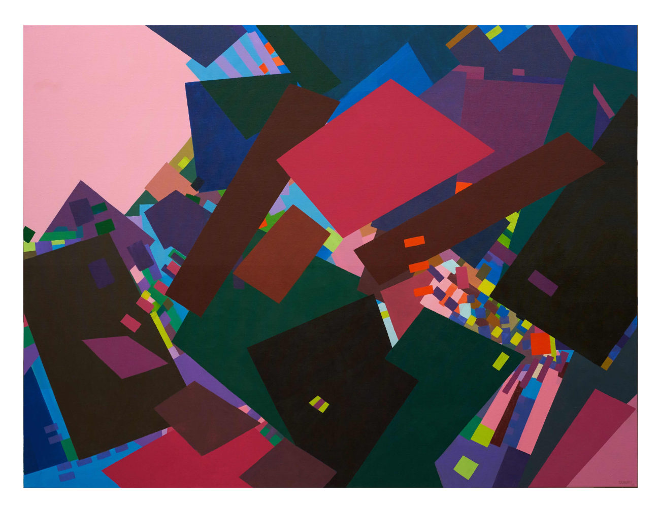
Figure 7: Samia Halaby, New York Avenues and Japanese Clouds , 2018, acrylic on canvas, 153 x 203 cm. Collection of the artist, New York.

beginnings in the Italian Renaissance, from the propaganda of its extreme decay. The artist must instead see that knowledge of Renaissance art is essential as is all art history, and that this is not reduced by Western propagandistic theft of 20<sup>th</sup> century abstraction.