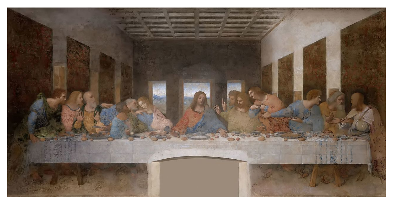
Figure 2: Leonardo da Vinci, The Last Supper, 1498, tempera and gesso, 4.57 x 8.84 m. Convent of S. Maria delle Grazie, Milan, Italy.