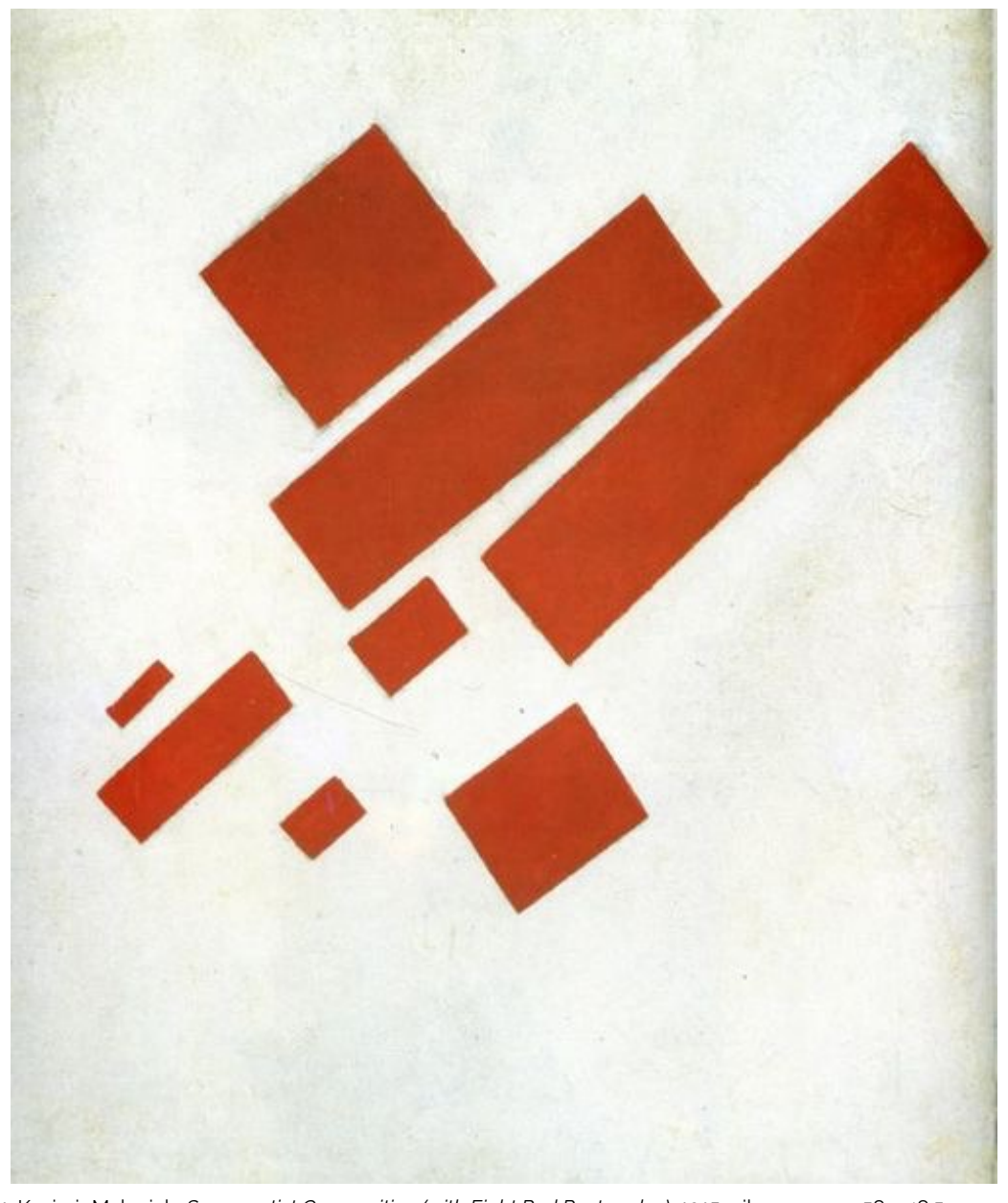
Figure 1: Kazimir Malevich, Suprematist Composition (with Eight Red Rectangles) , 1915, oil on canvas, 58 x 48.5 cm. Stedelijk Museum, Amsterdam.

Abstraction is present in every picture of mankind, since the very beginning, as a basic ingredient of the language of pictures. Composing any image is an exercise in abstraction. But pure abstraction in pictures occurred first in the panels of Islamic architecture and centuries later in 20<sup>th</sup> century abstraction. However, these two occurrences differ in their formal language substantially. This paper will not attempt in this context to properly describe the abstraction of Islamic panels but will continue focus on the political nature of 20<sup>th</sup> century abstraction.