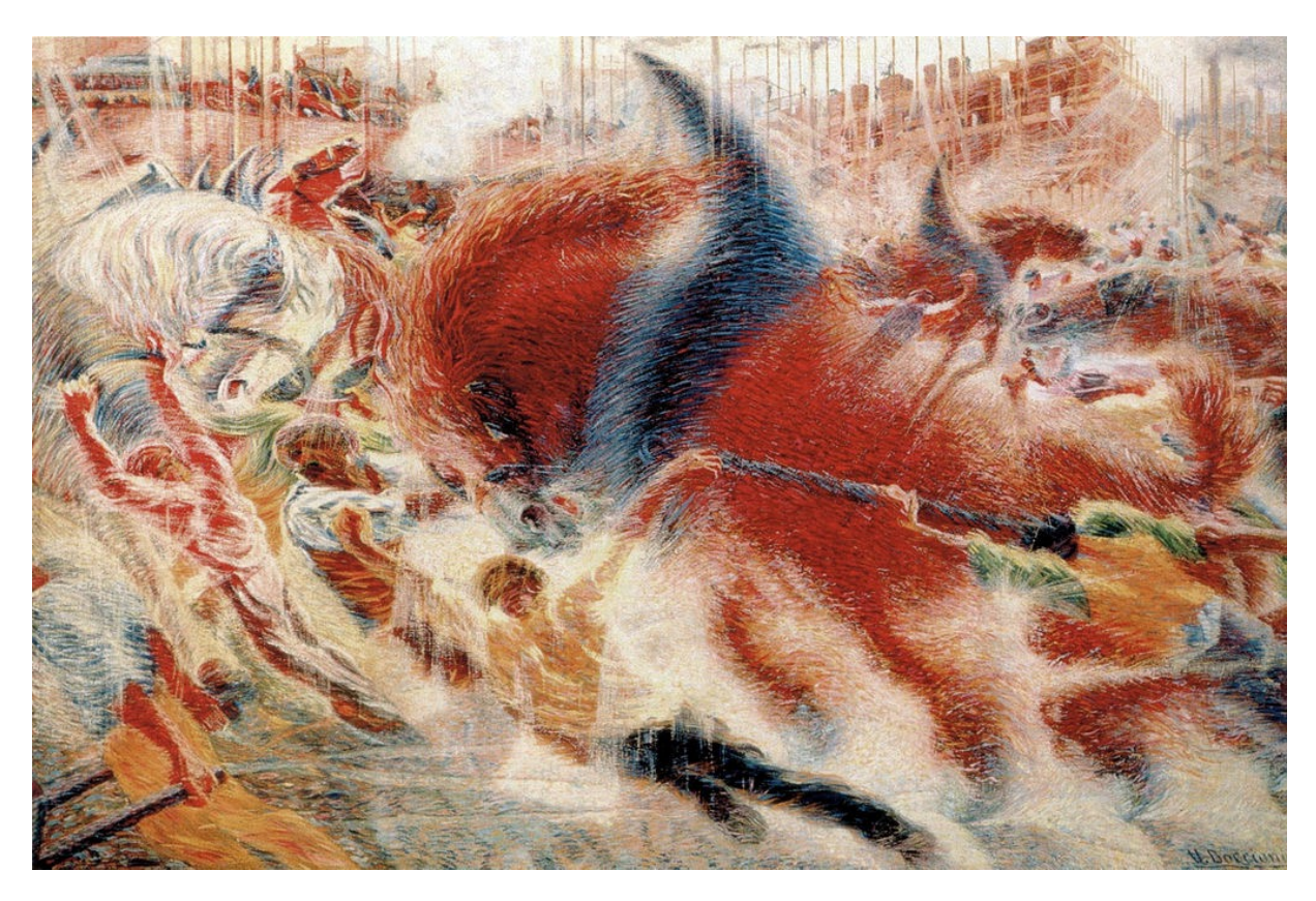
Figure 4: Umberto Boccioni, The City Rises , 1910, oil on canvas, 199 x 301 cm. Museum of Modern Art, New York.

The Futurists painters expanded the idea of time by exploring simultaneity. By merging the many things that take place at any one time in the excitement of city life, they challenged the logic of chronological narrative, of measurable space and perspective. Umberto Boccioni's painting, The City Rises , (fig. 4) 1910, represents this stage of growth in abstraction building on the advances accomplished by the Cubists.