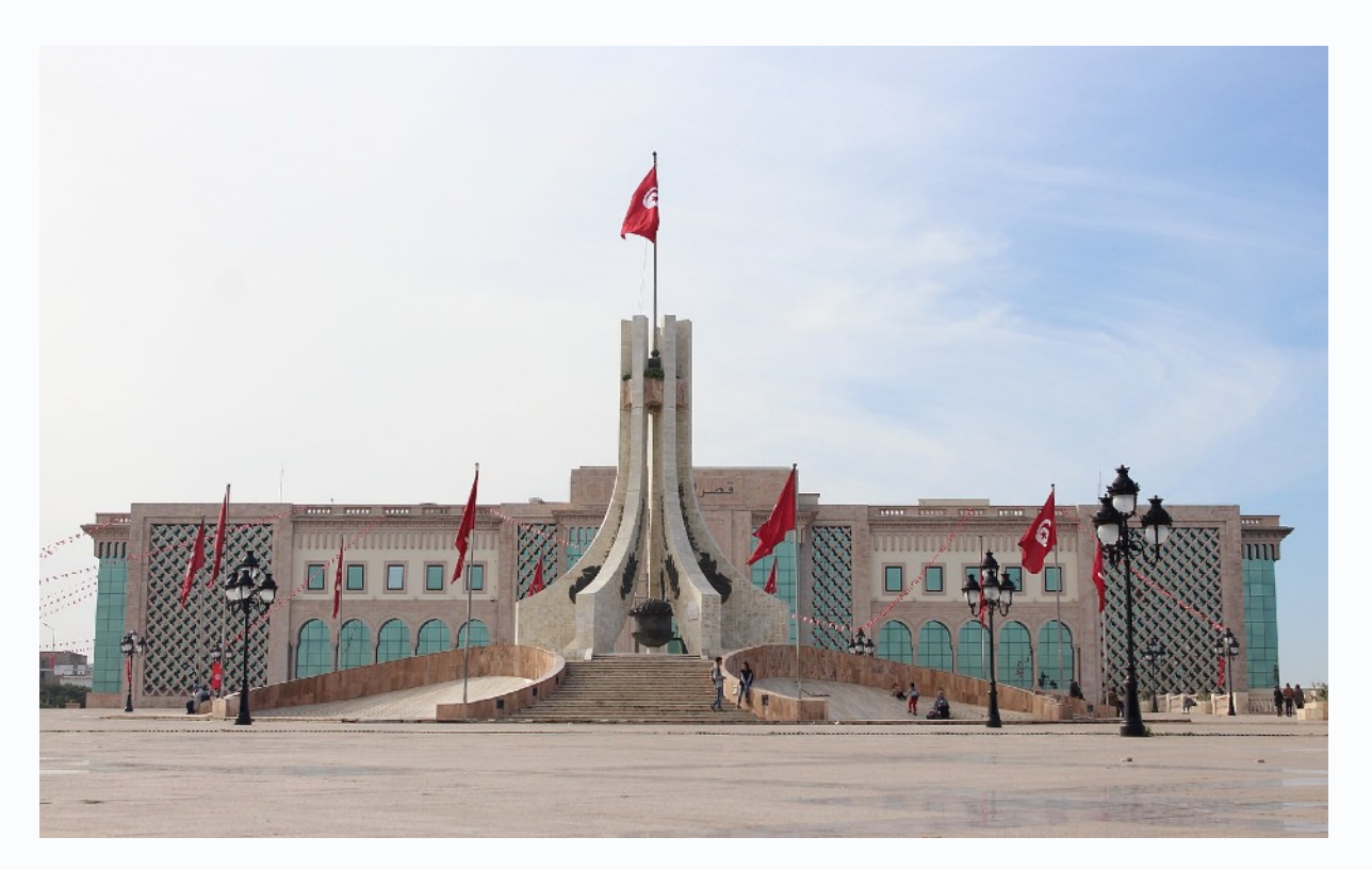
Figure 2: Kasbah Square (Tunis Town Hall).