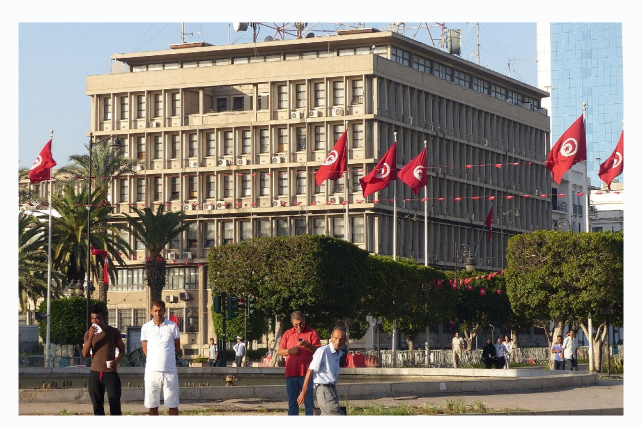
Figure 1: Headquarters of the Tunisian Ministry of the Interior overlooking Avenue Habib Bourguiba.