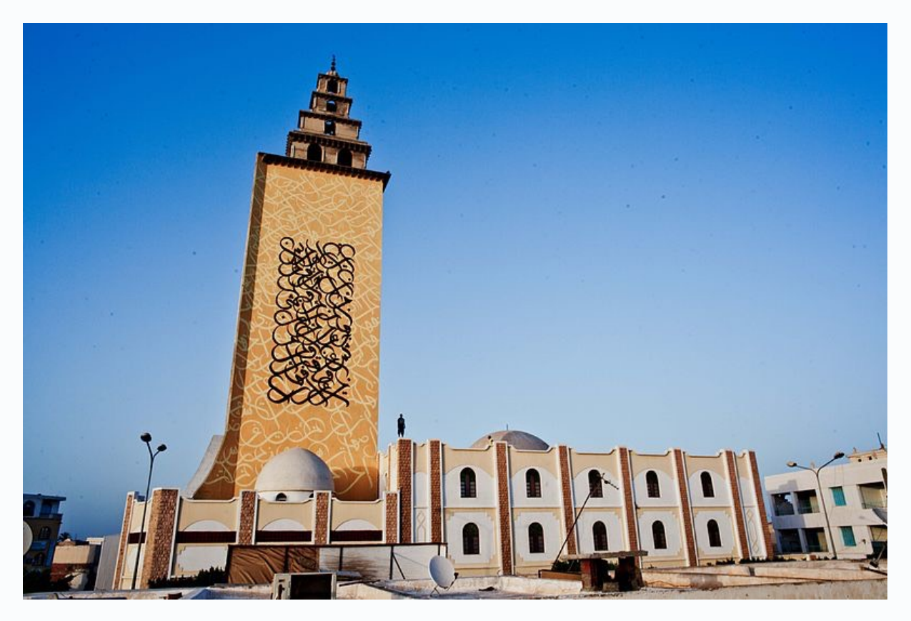
Figure 4: Jara Mosque, El Seed. CC BY 2.0