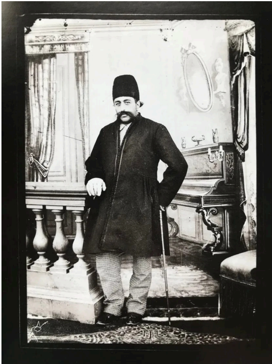
Figure 2: Unidentified photographer, Muzaffar al-Din Mirza , Tabriz, ca. 1887, unidentified photographic process (Album Khana, Gulistan Palace). Reproduced in Tahami and Jalali 24.