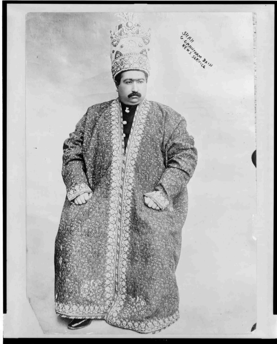
Figure 5: Muhammad Ali Shah as the New King, rephotographed, 1907, https://www.loc.gov/item/2004671397/. Accessed 16 July 2022.