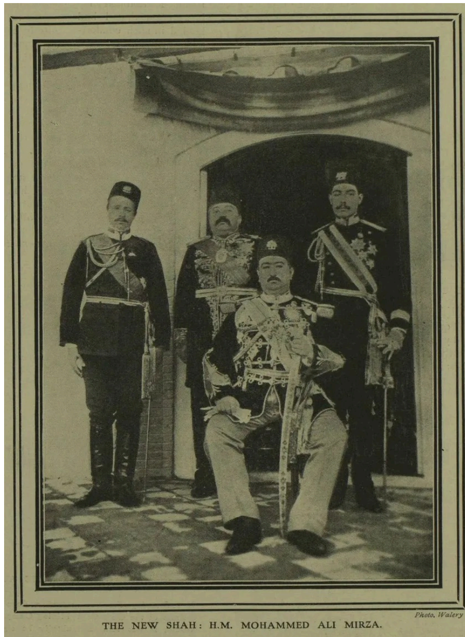
Figure 7: Walery, The New Shah: Muhammad Ali Mirza , in: The Illustrated London News , 19 January 1907, p. 87.