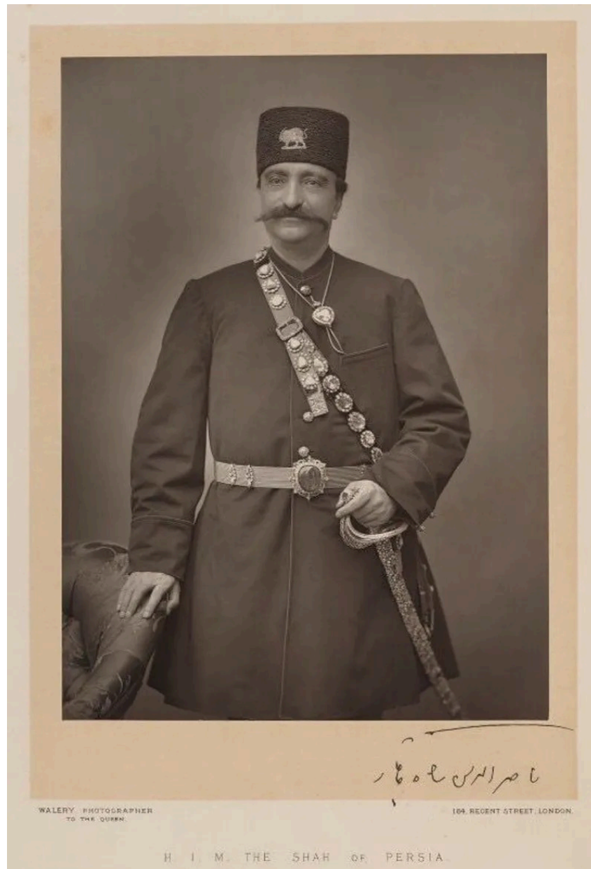
Figure 1: Herbert Rose Barraud, Portrait of Nasir al-Din Qajar Wearing Formal Attire , 1889, carbon print.