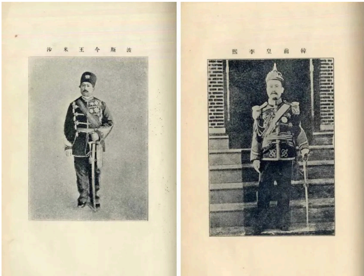
Figure 8: Muhammad ‘Ali, the New Shah of Iran and Yi Hui, the Former Emperor of Korea, reproduced in: Dongfang zazhi, no. 4, issue 6 (1907), 8-9. Accessible here: [ https://archive.org/details/dongfangzazhi-1907.08.03/page/n8/mode/2up ].