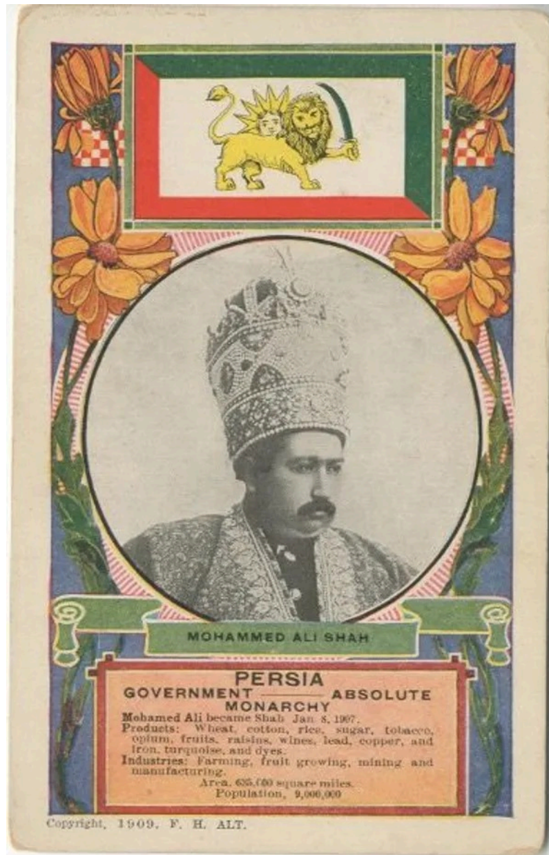
Figure 6: Unidentified photographer, Postcard Depicting Muhammad Ali Shah, published by F. H. Alt in 1909, collotype postcard.