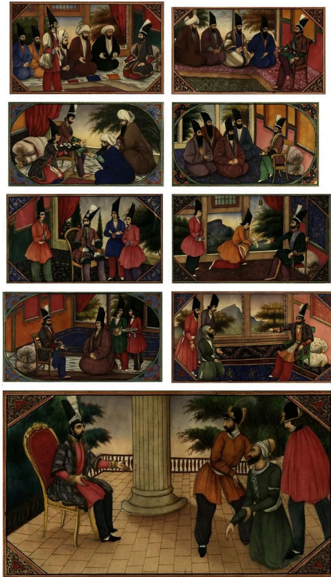
Figure 4: a) He is King Tighmus of Kabul who Has Summoned Fortune-Tellers to Tell his Fortune; b) The King of Kabul Sends his Vizier to Propose to the Daughter of the King of Khorasan (Night 496, Vol. 3, fol. 134b); c) Sitting on a Chair, Janshah is Sending Slave-Soldiers to Search the Island (Night 499, Vol. 3, fol. 138a); d) King Tighmus Offers Janshah Consolation; e) The King Gathers the Merchant Looking for the Castle of the Jewels (Night 513, Vol. 3, fol. 148b); f) The King Summons the Viziers (Night 514, Vol. 3, fol. 150b); g) They Have Brought the Reply to King's Letter, Before His Majesty (Night 515, Vol. 3, fol. 152a); h) King Kafid is Chained and Brought to King Tighmus (Night 527, Vol. 3, fol. 160b); i) King Kafid is Led to Before King Tighmus in Order to be Dismissed (Night 527, Vol. 3, fol. 162a). From the tale of "Janshah". One Thousand and One Nights, under the supervision of Sani' al-Mulk, watercolor, 15 x 7.5 cm (approximately), Tehran, 1859.