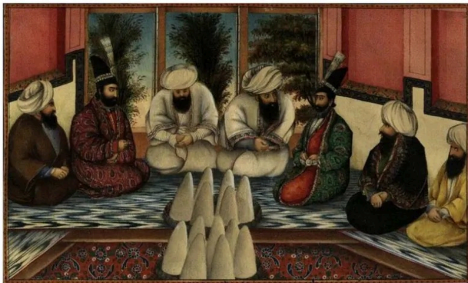
Figure 5: a) Sending a Messenger to the King (Night 108, Vol. 1, fol. 147b); b) The wedding Vow Between Princess Dunya and Taj al-Muluk (Night, 136, Vol. 1, fol. 179a). From the tale of "Taj al-Muluk and Dunya". One Thousand and One Nights , under the supervision of Sani' al-Mulk, watercolor, 15 x 7.5 cm (approximately), Tehran, 1859.