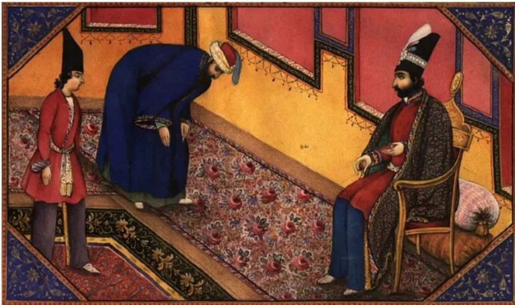
Figure 3: Above: Three Sages are Sitting and Talking before the King ; Below: The Third Sage is Explaining the Characteristics of the Ebony Horse . From the tale of the "Ebony Horse" (Night 354, Vol. 3, fol. 19b). One Thousand and One Nights , under the supervision of Sani' al-Mulk, watercolor, 15 x 7.5 cm (approximately), Tehran, 1859.