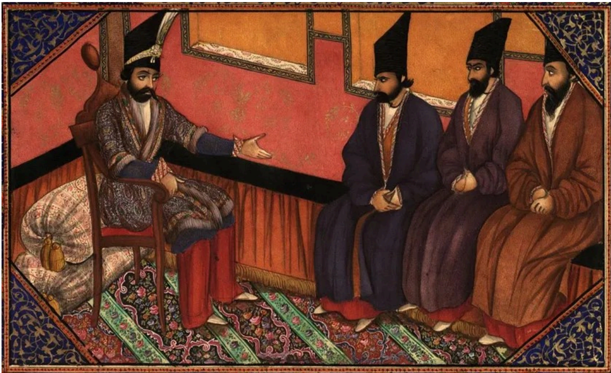
Figure 2: King Naser Summons his Governors, and They Narrate ; from the Tale of “Al-Malik of Nasir and the Three Chiefs of Police” (Night 340, Vol. 3, fol. 7b). One Thousand and One Nights , under the supervision of Sanī al-Mulk, watercolor, 15 x 7.5 cm (approximately), Tehran, 1859.

Afterwards, the third sage presents a horse of ebony that can fly and move the passenger to any location he wishes. The prince, in the presence of his father (Nasir al-Din Shah in the illustration), volunteers to test the horse (fig. 3). The horse moves into the air and returns. With the advent of this ebony horse, the love story of the king’s son begins ( Arabian Nights Encyclopedia 172-174).